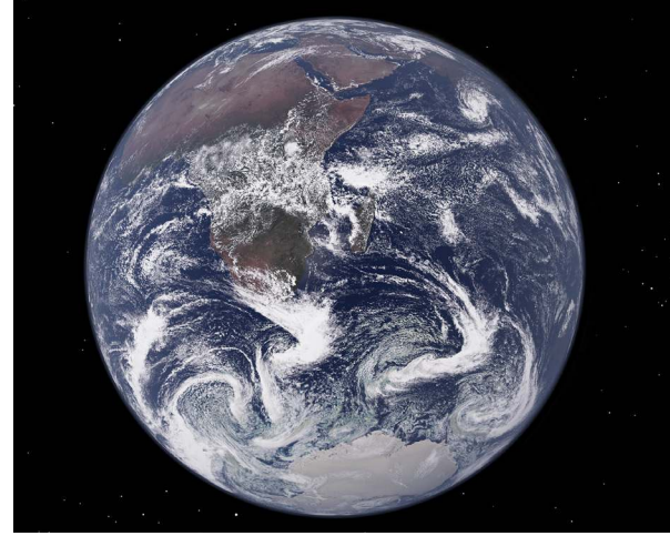
ICON prediction courtesy of MPI-M, DKRZ, and NVIDIA.

Skillful, high-resolution weather predictions with less energy and a smaller carbon footprint.